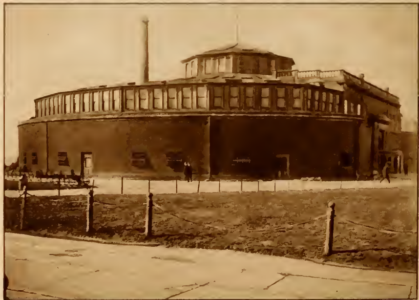
AQUARIUM. This building contains a remarkable collection of rarest fish.